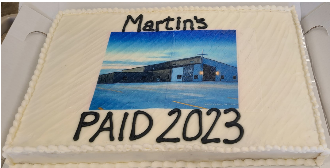
Celebratory cake to commemorate the mortgage being paid off.